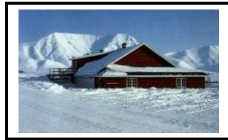
The future location of Spitsbergen Airship Museum, seen from south in April

So, if everything goes as planned, and we don't see why it shouldn't, the opening will be in the middle of November :D